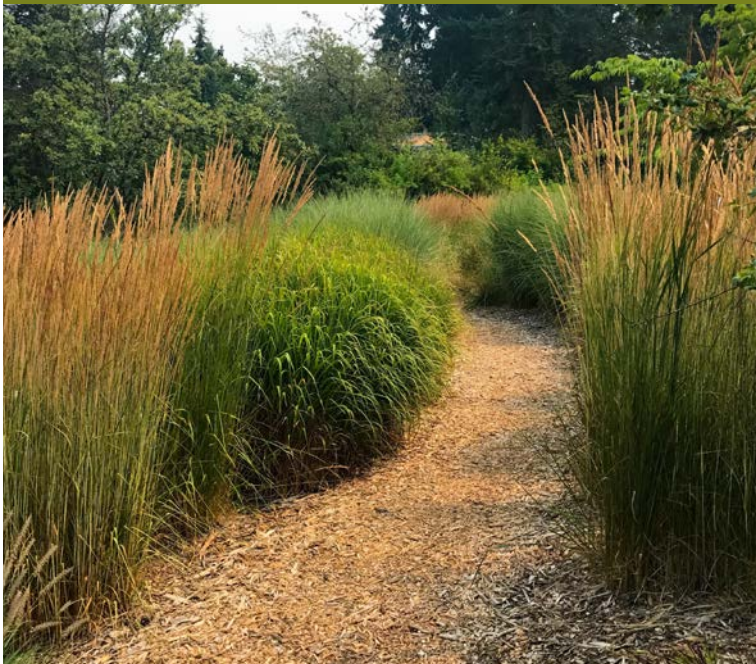
Figure 3. Ornamental grasses planted in a naturalistic design are reminiscent of a prairie.

Ornamental grasses are not just attractive; they provide many benefits to the environment. For example, root systems, particularly of perennial grasses, can grow into thick mats that prevent soil erosion. Studies have shown that erosion is reduced by at least 90 percent compared to bare soils (Gray and Sotri, 1996). Many grasses form deep root systems that can filter water percolating through soils, which helps keep groundwater cleaner. Over time, they also contribute to the organic matter of soils and loosen heavy soils. Grasses are also important for wildlife, including pollinators like butterflies, because they provide shelter and food; therefore, incorporating grasses into landscapes can help improve animal diversity.