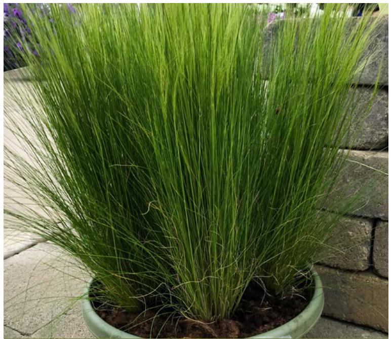
Figure 5. Stipa 'Angel Hair' on display at the 2018 California Spring Trials (CAST). CAST is an annual showcase of new products that are going to be introduced by ornamental plant development companies.

For example, one of the most diverse genera of ornamental grasses, Pennisetum , ranges dramatically in size, from 'Little Bunny' that grows just 9 inches to 'Black Stockings' that can reach over 9 feet. This