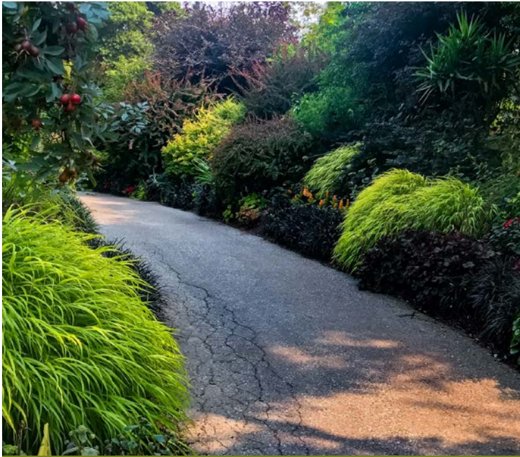
Figure 2. Grasses provide an interesting contrast of texture and form when planted with other landscape plants.

For example, grasses such as Pennisetum 'Cassian' nicely complement coneflower, elephant ear, hydrangea, and hardy hibiscus because the large leaves and flowers provide a formal look that contrasts nicely with grasses. The contrast in texture and form add to the overall beauty of the landscape (Figure 2). Grasses also add a natural element to the landscape and can be reminiscent of a natural prairie landscape (Figure 3).