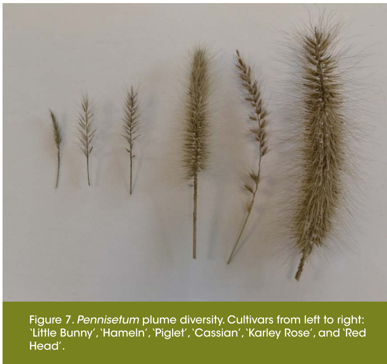
Figure 7. Pennisetum plume diversity. Cultivars from left to right: 'Little Bunny', 'Hameln', 'Piglet', 'Cassian', 'Karley Rose', and 'Red Head'.

woody stems and the aboveground tissue will senesce each winter. Even though the aboveground tissue will turn tan or brown and dry out, the roots will remain alive, but dormant, until the following spring.