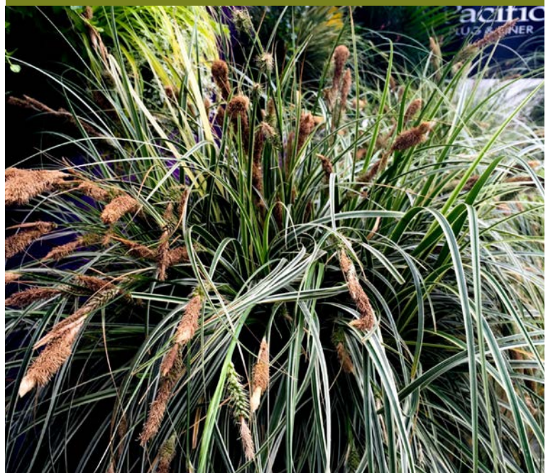
Figure 6. Carex 'Feather Falls' is a tough evergreen option that tolerates both shade and full sun.

means that they can be used in different places within the landscape, such as the front of a flowerbed or as a backdrop. They also vary in winter hardiness, leaf color, and plume size (Figure 7).