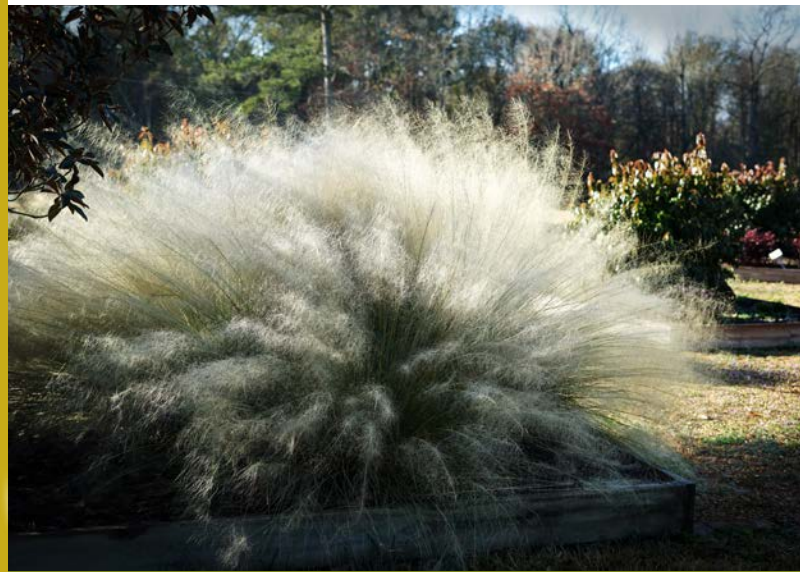
Figure 1. Muhlenbergia capillaris 'White Cloud' in the morning light.

Grasses create useful and interesting landscape design elements, particularly by providing unique textures and movement in the landscape that cannot be achieved with other plants. They are particularly attractive during the morning and evening hours when sunlight passes through the plumes and blades, giving them a glowing appearance ( Figure 1 ).