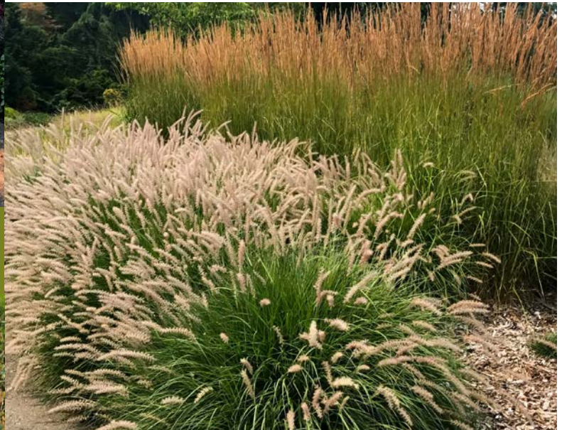
Figure 4. Ornamental grasses have different growth habits, some growing straight up and others gracefully draping downward.

Growth habits of ornamental grasses differ. Some are strictly upright, while others gracefully drape downward (Figure 4). Some grasses spread horizontally