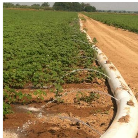
Figure 1. Water movement through a TWR system. Note that not all TWR systems have the same components. Some TWR systems are comprised of only a large TWR ditch and no on-farm storage reservoir (OFS). Top left: Nutrient- and sediment-laden water running off a field in the Mississippi Delta region. Top right: Runoff water being captured by a TWR ditch. Bottom left: Nutrient- and sediment-laden water being pumped into an on-farm storage reservoir. Bottom right: Surface water being irrigated from a TWR/OFS system.