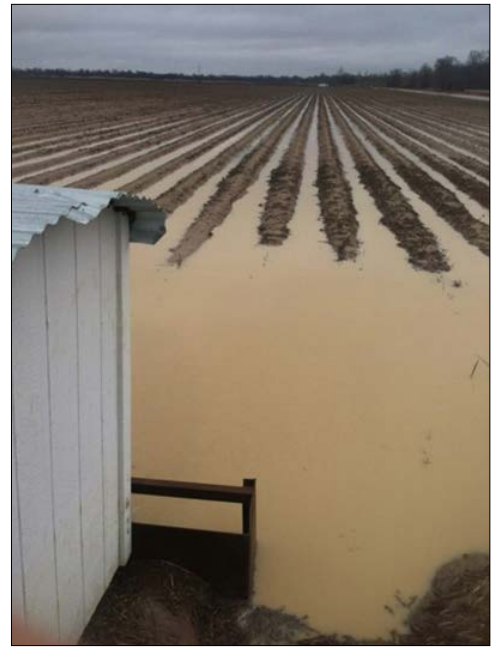
Figure 4. Runoff leaving a field after a precipitation event in the Mississippi Delta region. The small building on the bottom left houses water-quality sampling equipment used to monitor runoff leaving the field and entering the TWR system (not pictured).