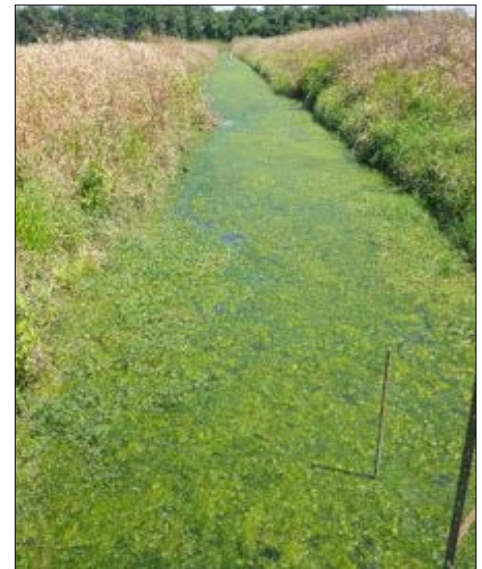
Figure 2. Plant and algal growth in TWR ditches in Mississippi's Delta region.