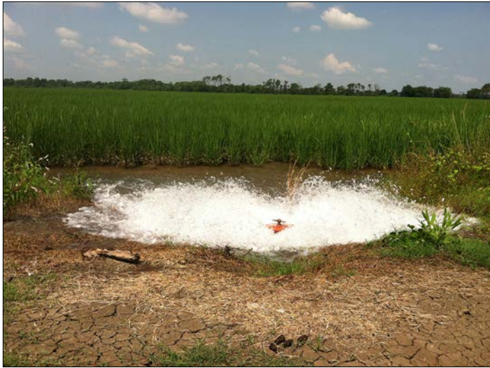
Figure 6. Rice irrigation with water from a TWR system in the Mississippi Delta region.

Runoff captured by a TWR system is stored and reused as irrigation water, allowing potentially available nutrients to be put back into the field to meet crop needs (Figure 6). Results from this study showed relatively low nutrient values available per acre in TWR water stores (Table 2). The available amount of nutrients will fluctuate throughout the year with changes in temperature, precipitation, and fertilizer inputs in the field.