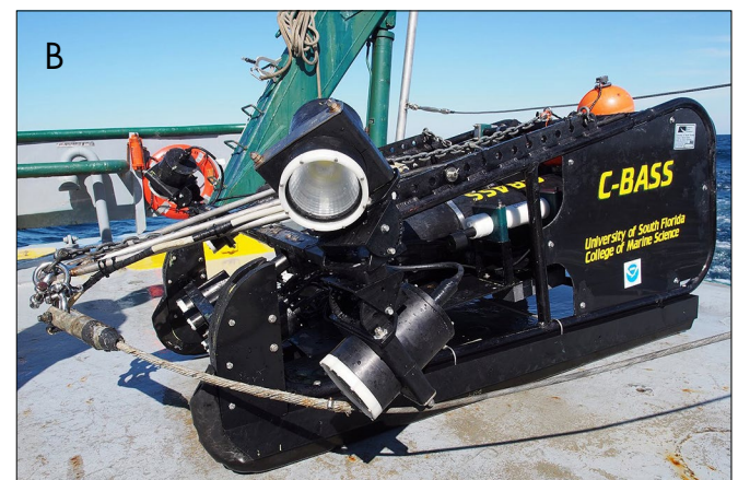
(A) An ROV, the VideoRay Pro 4, and (B) a towed camera, the Camera-Based Assessment Survey System (C-BASS), are used for direct visual counts.