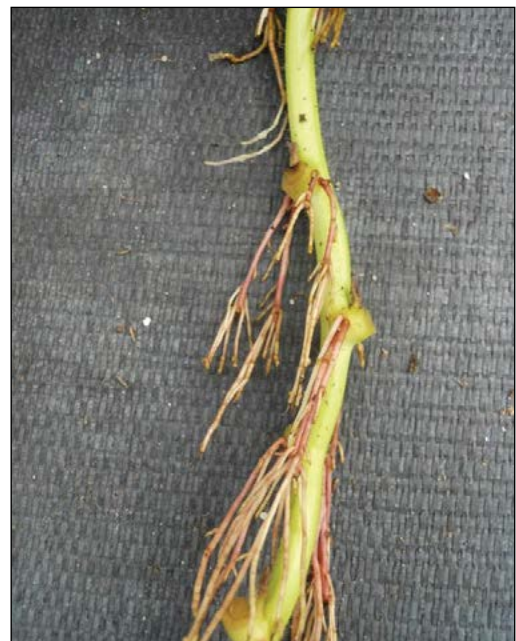
Figure 2. Under ideal conditions, roots begin to grow in as little as 24 hours after transplanting sweetpotato slips.