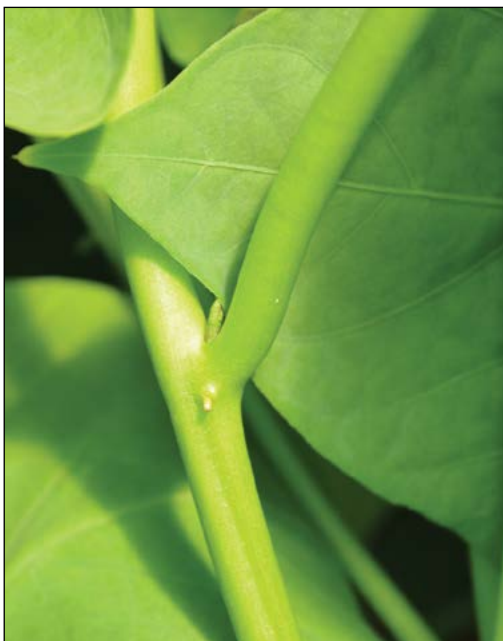
Figure 1. Sweetpotato roots begin as preformed root primordia, which are white bumps located at nodes along the stem of the sweetpotato.

An adventitious root can become one of three different types of roots ( Figures 3 and 4 ). Under ideal growing conditions, adventitious roots become storage roots . However, if adventitious roots are damaged at or before planting, fibrous roots are generated, and these will not become storage roots. In addition, adverse or unfavorable environmental conditions shortly after transplanting may result in pencil root production (thin, elongated