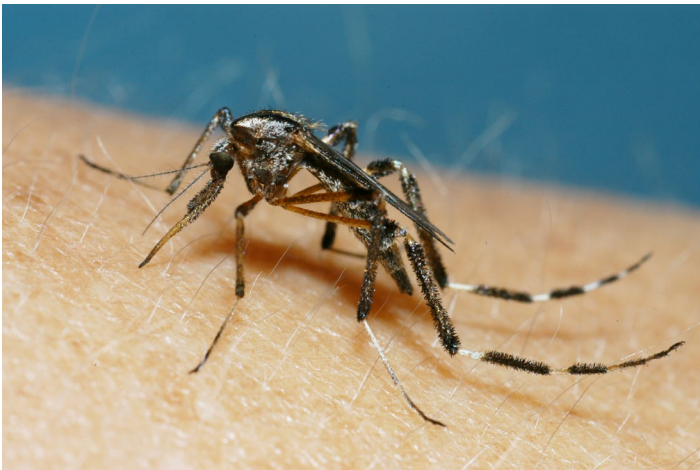
Figure 1. Adult female Psorophora mosquito, a vicious mosquito in Mississippi (Photo courtesy Dr. Blake Layton, MSU Extension).

Mississippi has 60 species of mosquitoes, but only five or six of them are significant pests. Most are relatively rare and associated with a narrow host range or unusual ecological niche. For example, some species feed only on frogs, so they have little or no interaction with humans, and others live only in certain pitcher plants along the Gulf Coast. The major pest mosquitoes in Mississippi are those that breed in high numbers and are important because of nuisance biting and/or disease transmission.