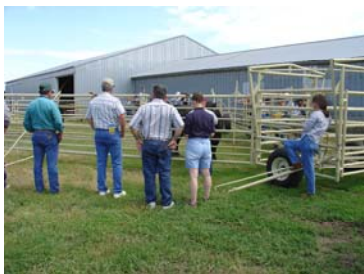
Tours of Missouri cattle operations will be included in the BIF meeting

Registration is now open for the 2010 Beef Improvement Federation (BIF) annual meeting and research symposium. This year's BIF convention will be held in Columbia, Missouri from June 28 through July 1, 2010. Detailed convention information is available online at www.bif2010.com . This includes registration, lodging, and travel information