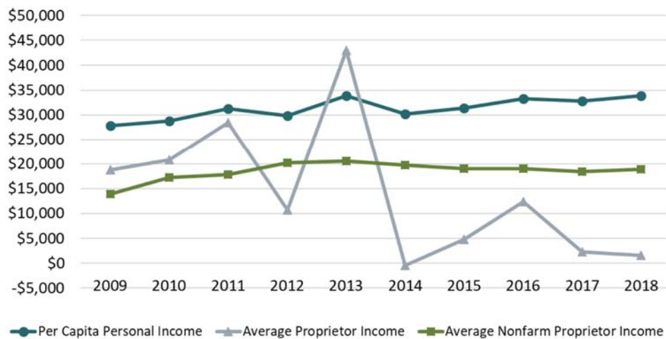
Per Capita Personal Income versus Average Proprietor Income Coahoma County

Annual payroll is reported in thousands of dollars.