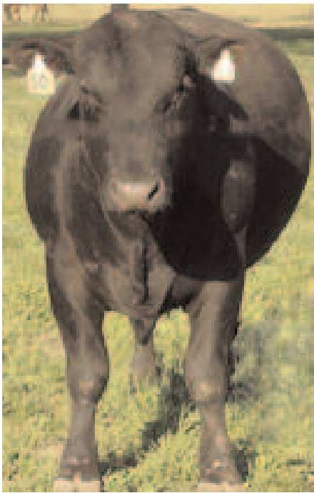
Bull displaying a distended upper left side, indicating bloat.