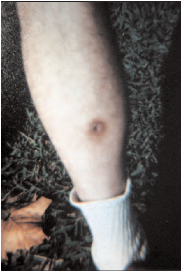
Brown recluse bite on leg 4 months after the bite.