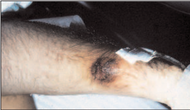
Brown recluse bite in the early stages of necrosis.