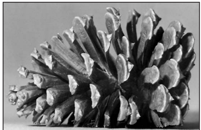
Figure 3. Cutting a fruit sample for mounting.