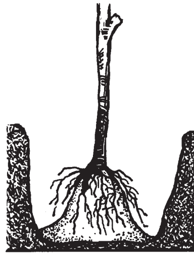
Planting bare-root on a crown of soil.

Make a 3- to 4-inch berm or raised area surrounding the root ball. (A berm is a ring of soil around the base of the plants outside the planting hole. This helps hold water and protects the shrub or tree from possible damage by a lawn mower.) Be sure the berm is well beyond the edge of the root ball so water will be directed to the right place. If drainage is poor, remove the berm after the plant is established because you do not want to direct any more water to the hole.