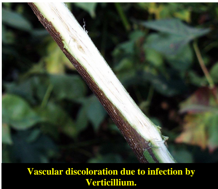
Vascular discoloration due to infection by Verticillium .

to occur at the same time as symptoms are developing on the leaves and petioles. Verticillium dahliae is capable of surviving in the soil as well as on dried leaves and stems for in excess of 10 years. Verticillium can reduce cotton growth and development as well as lead to shed of young squares. Yields tend to be less affected by late-season infection compared to infection earlier in the season. Verticillium also tends to be more pronounced during cool, wet seasons. As previously noted, moisture in late July moisture was abundant. Air temperatures in July were also more moderate than normal with the 87°F being the average daily high and