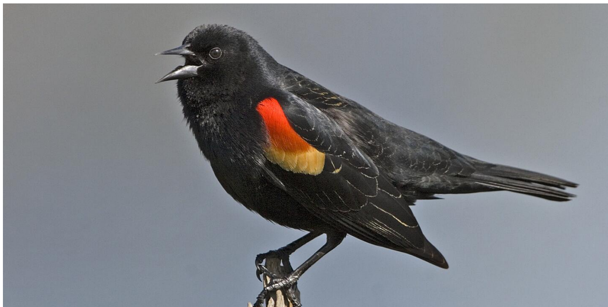
Figure 1. Mississippi growers may use Avipel to reduce blackbird depredation in freshly planted corn fields.

Bird Repellent Exemption - The EPA has granted the Mississippi Department of Agriculture a Section 18 exemption allowing the use of anthraquinone (Avipel™) for the purpose of repelling blackbirds, grackles and crows in newly planted field or sweet corn in the state of Mississippi. Avipel's active ingredient is a natural, non-lethal compound proven to repel birds. Avipel is available for use on corn seed as either a liquid or dry formulation. The liquid formulation has demonstrated very reliable performance on large avian species, such as cranes, and is the preferred formulation for high bird pressure fields, but does require commercial seed treating prior to planting. The dry formulation offers growers the convenience and speediness of hopper-box treatment, but its effectiveness is dependent upon thorough seed coverage and gentle handling. For example, performance of the dry material may not be as good as the liquid form when used in planters with air or vacuum seed metering systems, because the air circulation may remove some of the product from seeds before planting. The use of supplemental dry lubricant on the corn seed may also reduce Avitec seed coverage and/or adherence of the dry formulation, and subsequent repellency.