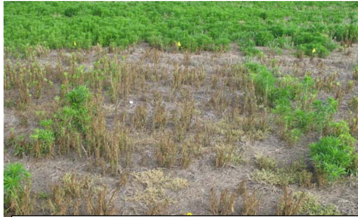
Figure 2. Ignite 280 SL (29 oz/A) at 14 days after treatment. 100% control.

In the north part of the delta where glyphosate-resistant horseweed has historically been worse than in other parts of the state, we have had quite a few growers grow Liberty Link cotton over the past several years so that they have an inseason option to control glyphosate-resistant horseweed. This system allows for multiple inseason applications of Ignite to not only control glyphosate-resistant horseweed but most other problematic weeds. This system, however, just like glyphosate in Roundup Ready cotton, does not provide residual weed control. So residual herbicides should be utilized in Liberty Link cotton just like they should be in Roundup Ready cotton.