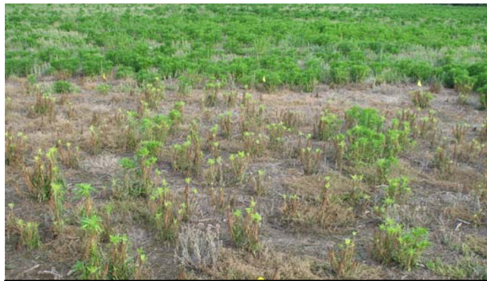
Figure 1. Gramoxone Inteon (3 pt/A) at 14 days after treatment. Growing point not controlled on most plants. Plants were 14-20 inches tall at time of application.

horseweed was really big (12-24 inches tall) and there was a lot of it. We don't have many options to control horseweed at planting. We are all familiar with the use of dicamba (Clarity or Banvel) or 2,4-D in a burndown program to control glyphosate-resistant horseweed. However, dicamba must be applied at least 21 days before planting and 2,4-D at least 90 days before planting cotton and you are supposed to get some rainfall between the dicamba application and planting if you go with the 21 days before planting guideline. Currently, Ignite (glufosinate) or Gramoxone Inteon (paraquat) are really our only "at planting" or "just before the crop emerges" options to control horseweed. We have seen a lot of inconsistent control of really big horseweed with paraquat. Small horseweed that is still in the rosette growth stage before it bolts is easily controlled with paraquat. However, once horseweed bolts or goes from a rosette to having a stem we are seeing a lot of inconsistent control with Gramoxone Inteon. We are controlling some populations that have bolted with a 2 to 3 pint/A application of Gramoxone Inteon, but in some fields we burn off the bottom of the plant but the growing point (top of the plant) doesn't die and the plant resumes normal growth within a week or two (see figure 1).