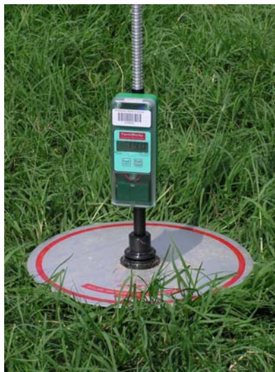
Figure 3. Visual representation of using the falling/raising plate meter