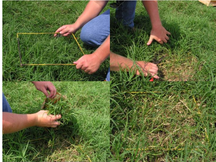
Figure 1. Clipping, weighing, and drying the forage biomass is the most accurate estimate of forage availability but not economical and time consuming.

Using a conventional oven is time and energy consuming. It is recommended to use a microwave oven.