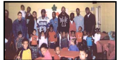
Friends of Children, Inc. parents and children attend planned event to educate fathers about Men's Health Awareness