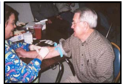
Company representative from one of the workforce industries has PSA screening