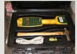
Carter Holt Harvey – Director 200.

Non destructive testing of MOE is also available using: (1) a Metriguard E-Computer or (2) a Grindo. A number of conditioning chambers are available to equalize specimens at various moisture contents.