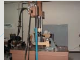
Tinius Olsen with Instron Software configured for block shear testing. 25(Kip).

Block shear and most ASTM tests for lumber and engineered wood can be performed.