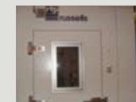
RTP Russels walk in conditioning chamber.

A high capacity creep tester is being fabricated and will be available for use.