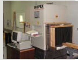
Inspex X-ray System

Product density variation examination can be performed on large samples using the Inspex X-ray system. This unique piece of equipment can inspect samples 16 inches wide and at least up to 20 feet long for density variation.