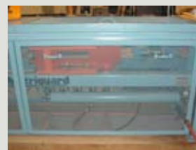
Metriguard tension tester.

Tension testing can be performed on several machines including the Metriguard tension tester at a number of guage lengths. The Metriguard tension tester has a 100,000 pound capacity.