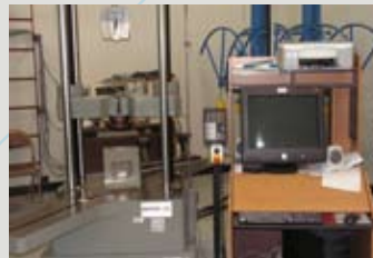
Satec machine with Instron electronics configured to test furniture frame joints. 60(kip).

Scientists within the Department also have the expertise to test other kinds of end-use applications such as furniture and cabinetry components.