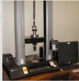
Instron tabletop testing machine for MOE, MOR, and IB. 2(kip).

Two table top machines are available for intermediate size MOE and MOR samples and are also configured for internal bond (IB) testing. The software that controls all of the universal testing machines is identical, making setups quick and easy. Once tests have been performed, the data are available for printed reports and also written into a database so design loads can be quickly calculated.