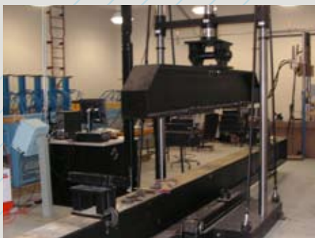
Universal Testing Machine with a 24 foot bed. 130(kip).

Very small samples may also be tested on specialized machines for modulus of rupture (MOR) and modulus of elasticity (MOE).