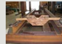
Creep frame assembly.

A high capacity creep tester is being fabricated and will be available for use.