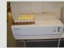
QMS Density Profile Machine

Small sample density profiles can be examined across the face of samples using a QMS density profile X-ray system.